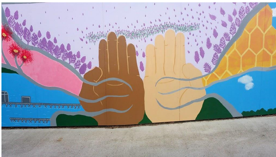
Image Source: "Two hands united, Behind Kingscote Council Chambers." by Stephen Mitchell is licensed under CC BY-NC-ND 2.0